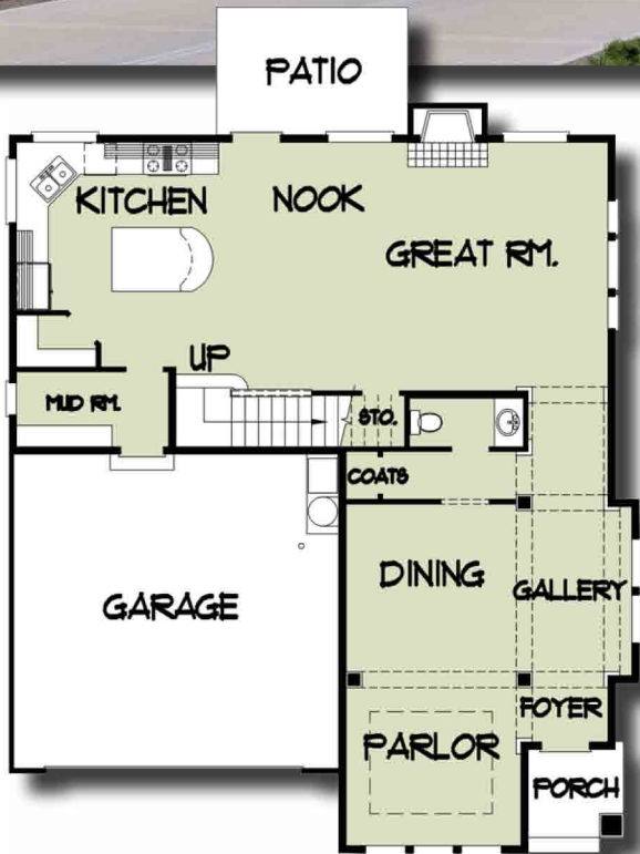
MAIN FLOOR: 1,173 SQ. FT.